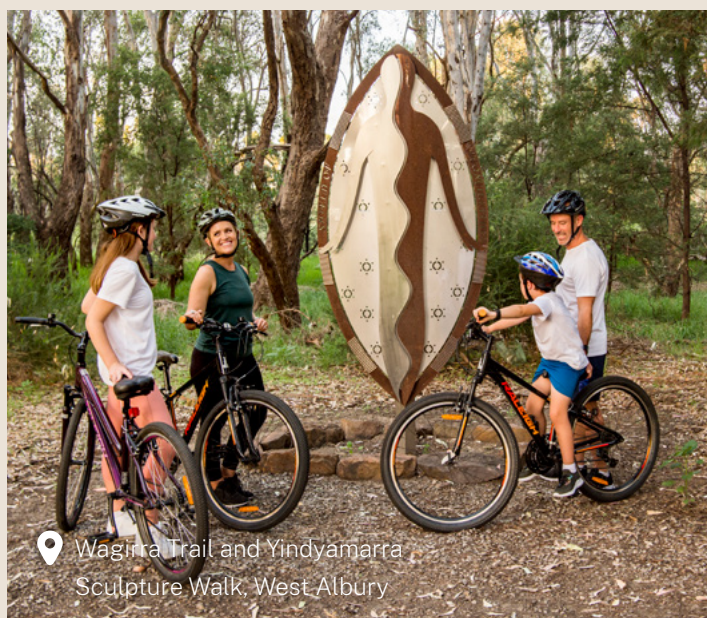
Waginta Trail and Yindyamarra Sculpture Walk, West Albury